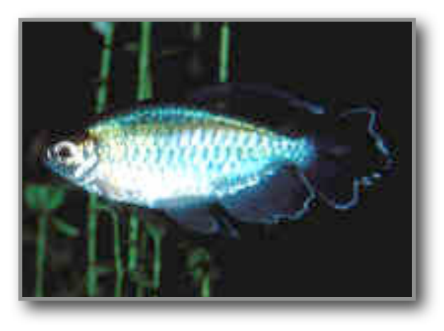
Phenacogrammus interruptus (Boulenger 1899)

A hodge-podge approach to stocking ones aquarium system is to be guarded against... These "garden variety" mixes of supposed "community" organisms rarely work out satisfactorily... With unneeded tension, extra maintenance and poor showing, growth and behavior of specimens as consequence of slipshod, inadequate investigation ahead of their acquisition. Do be a conscientious consumer and look into the needs and compatibility of the life you intend to keep before buying it. To the extent that you know what you're doing, so much more will be your enjoyment and understanding of your aquarium world.