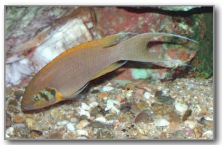
Neolamprologus pulcher "Daffodil'

like other open water fish require lots of swimming space so are not