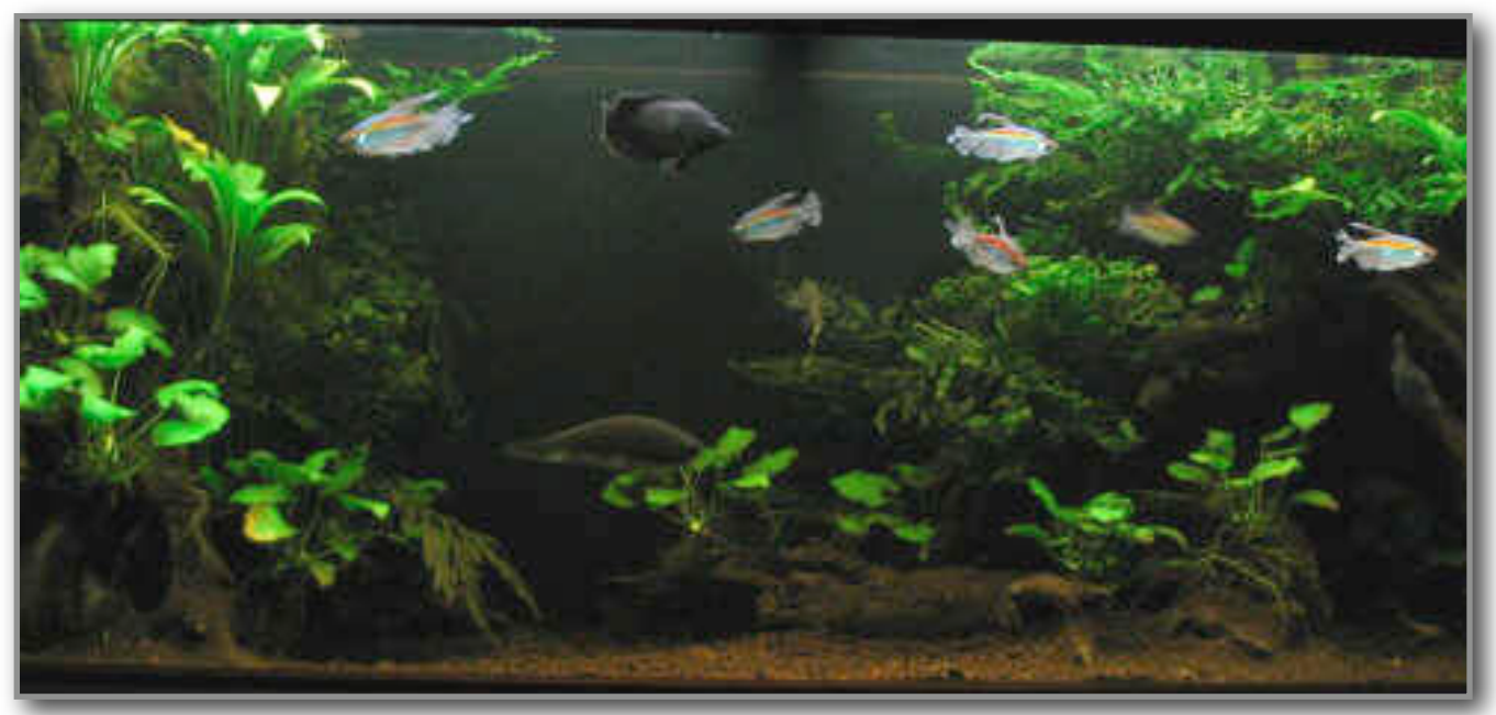
Travis fabulous Zaire River tank...