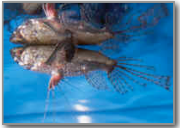
Pantodon buchholzi Peters 1877

Most folks will be finding themselves already in a "fixed" position of having a set-up in hand, or at least the principal components. Given this perspective, or starting point, you can work out what you might want to keep in a few ways... My favorite approach involves building a collection around a "must have" organism... Something that I really want to keep... and working from there in making sure the conditions that my "number one" piece