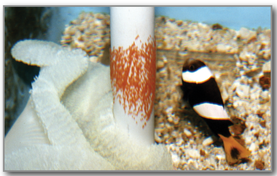
Figure 1: Parental care in sebae clownfish

Parental care in clownfishes is well known, mouthing and fanning are the important behaviours apart from defending eggs from predators. They fan the egg mass using pectoral and caudal fins and thus provide necessary water movement to the densely packed clutch and thus help in faster