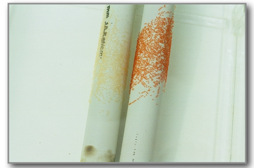
Figure 2: Sebae clownfish eggs on the PVC stand pipe

This behaviour might be an adaptation to ensure the survival of species governed by their social instincts. As the clown parents care for their eggs continuously it's difficult to assume that the fishes were unaware of the change. Moreover the egg colour itself was continuing for the past six consecutive spawnings i.e. more than two months. This may be the case in nature also where the threats from