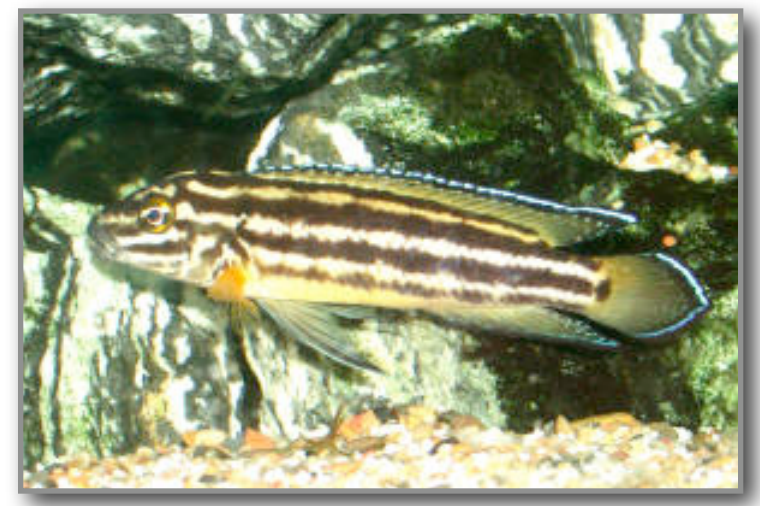
Julidochromis regani "Sumbu"

These facts should make it clear that both bodies of water are more like small