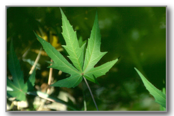
Hibiscus coccineus leaf

Hosta lancifolia (Liliaceae) is a perennial plant from China and Japan. This species is appreciated for its decorative green leaves and though it will do well in shady spots it needs good sunlight for several hours per day if it is to bloom. You can plant Hosta in fertil soil in March or October, from June till September you'll enjoy the graceful lilac flowers. Hosta rarely produces seeds, so it is easier to reproduce this plant by splitting mature plants. Plants reared from seeds often do not look much like the parent plant.