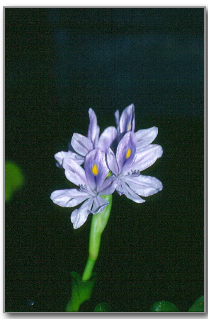
Eichornia crassipes flower

April. Remember: this plant doesn't like hard, alkaline water or earth and direct sunlight. Iris can grow up to 80 cm and are perfect for pond borders, planted in clumps.