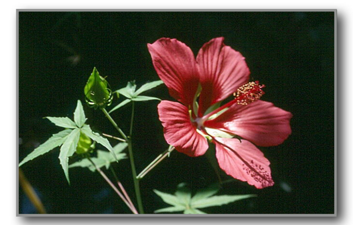
Hibiscus coccineus flower

Houttuyinia cordata (Saururaceae) comes from China and Japan and has very beautiful green leaves with red or white edges. Unusually for bog plants, Houttuyinia have a delicate scent that attracts butterflies. In March or September you can plant this species eight centimeters deep, laying horizontally the rhizome, during the summer the flowers will bloom, but if the season is warm we can have two flowering each year. This plant will reproduce without problems; you have only to wait! H. cordata can live in a shady corner of the pond, but to maintain the red leaf edge it needs strong but not direct sunlight.